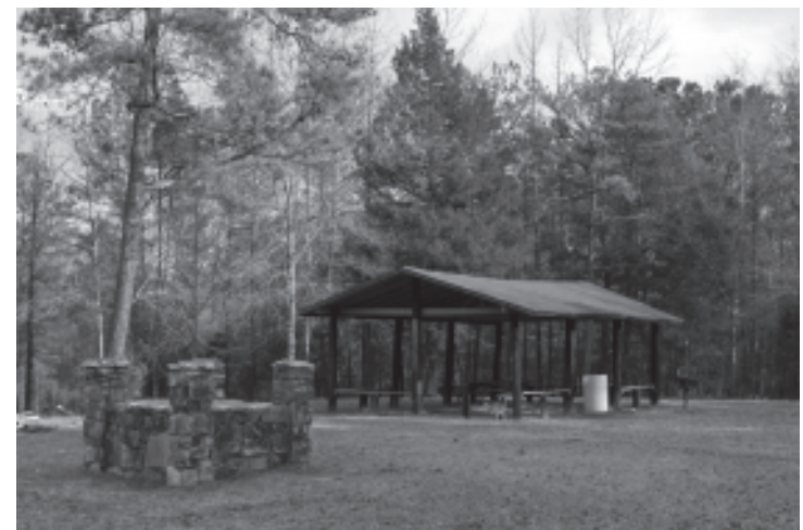
The CCC Camp pavilion near Chewacla State Park