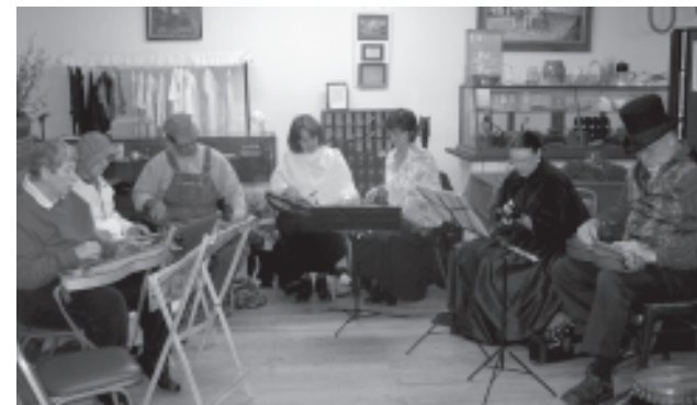
The Whistle Stop Pickers Dulcimer players practice and entertain in the Trade Center every Second Saturday.