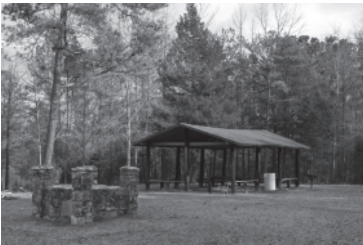
The CCC Camp pavilion near Chewacla State Park