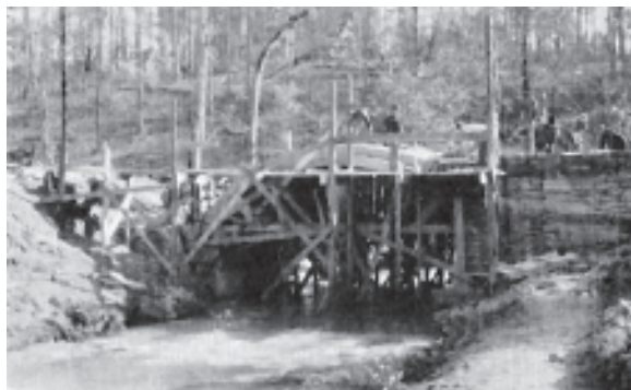
Construction of the arched bridge at Chewacla.