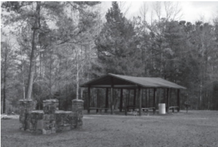
The CCC Camp pavilion near Chewacla State Park