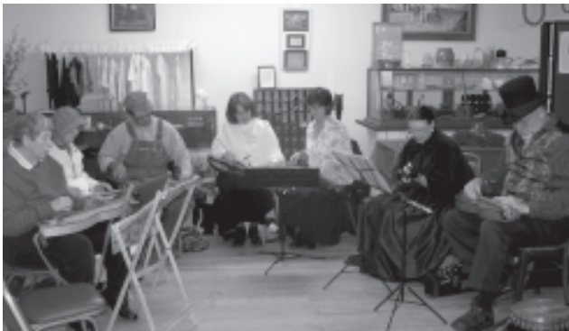
The Whistle Stop Pickers Dulcimer players practice and entertain in the Trade Center every Second Saturday.