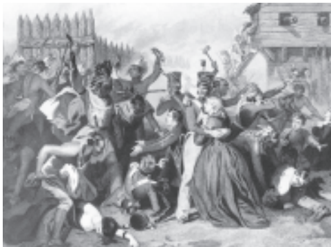
Massacre at Fort Mims