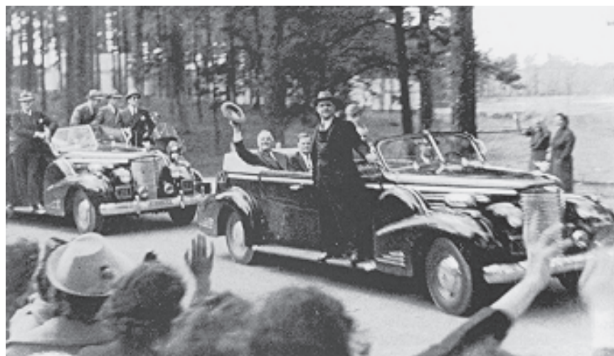
President Roosevelt rides onto the campus in Auburn on March 30, 1939

Seeing the President in person in Opelika made a lasting impression on this 14-year-old boy.