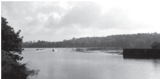
Langdale Dam, on the Chattahoochee River between Valley, Alabama and Georgia, was built about 1908.