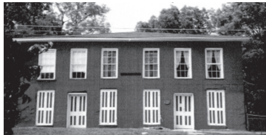
The Old Trade Center, built in 1845, currently serves as the main museum building for LCHS. It is the oldest commercial building still in use in Lee County, and has been on the National Historic Register since 1973.

LCHS is a non-profit corporation under Federal Regulation 501 3c and all donations are tax deductible.