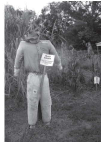
Freddie the scarecrow looks pretty exhausted after guarding the Crops Garden all summer.