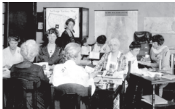
Birmingham Public Library Archives

The Birmingham headquarters for the AESA opened in 1912. AESA’s demonstrations in Birmingham included “voiceless speech” in store windows displaying suffrage materials and a mobile library with materials to spread the organization’s message.