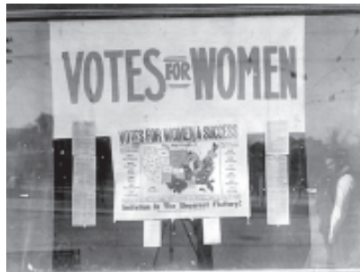
Birmingham Public Library Archives

The AESA opened its headquarters in downtown Birmingham in 1912 and began its outreach to young working women by setting aside a reading room where they could relax and eat lunch during the day. The AESA also established a traveling library, stocked