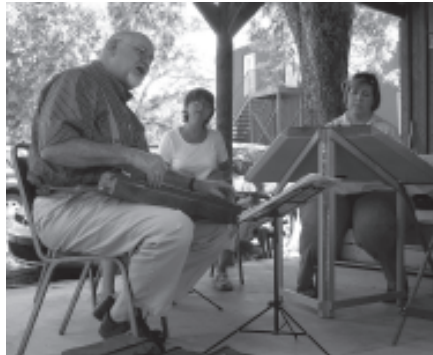
Dulcimer players practice on Second Saturday at 2:00pm.

The second Saturday of every month, a group of history re-enactors gather at the LCHS Museum in period costume. Blacksmiths are usually working at the forge, spinners and weavers are in the log cabin, and someone is always cooking up a meal in the fireplace or outdoors. On most Second Saturdays, a dulcimer class and jam session is held at 2:00 pm. What a great opportunity for LCHS members and visitors to visit the museum!