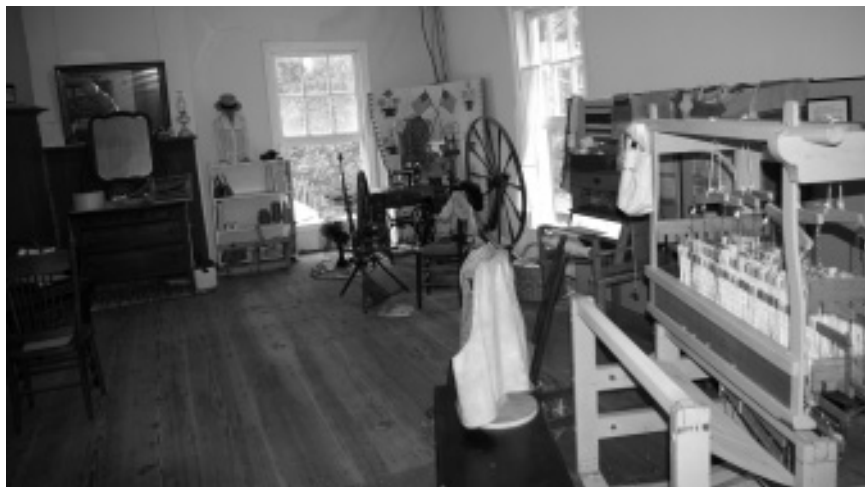
The textiles display has moved to the second floor of the Trade Center. The military display has moved into the east hall of the Trade Center, and the one room school exhibit is now in the east room of the log cabin.

The next step is weaving. There are many ways to accomplish this. We are using a loom that was made by hand about 1880, in southern Indiana. A smaller LaClarc "Dorothy" loom is available for use by children on Fair Day and during school tours. The "Dorothy" was originally used as a sample loom to try out a pattern before committing a much larger quantity of yarn to the larger loom. Fabric strips have been produced over the years and are