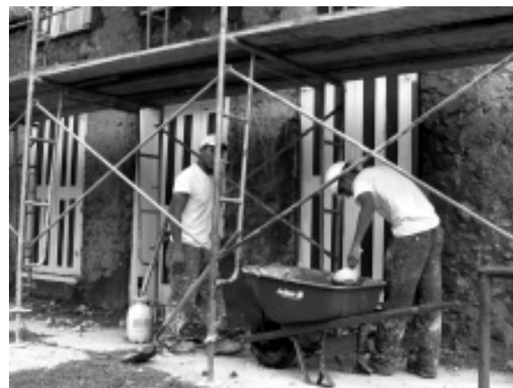
Workers from Simpson Plastering Co. remove and replace the exterior stucco on the Trade Center. The restoration should help preserve the building for another 164 years.

Donations to this fund are kept in a separate account and when there is enough on hand we will proceed with the work. All donations are tax deductible. Checks should be made payable to LCHS and mailed to LCHS, P.O. Box 206, Loachapoka, AL 36865 . Thank you for your support!