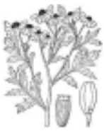
Feverfew ( Tanacetum parthenium )

though not used in England before the 15th century. By the end of the 17th, it was in American gardens. Most of the other varieties of salvia came from Brazil and Mexico, including “cardinal flower” ( Salvia fulgens ), and blue salvia ( Salvia patiens ). Sweet William ( Dianthus barbatus ), came from western Europe, the Near East, and Turkey. Henry VIII grew it at Hampton Court and Jefferson at Shadwell in 1767. Tansy ( Tanacetum vulgare ) was native to En-