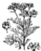
Rue ( Ruta graveolens )

was from southern Europe and Turkey. It had been grown by Romans for garlands and coronets and was associated with fidelity. Mentioned in Britain by the 11th century, it reached America by 17th.