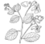
Touch Me Not ( Impatiens balsamini )

The Far East provided a number of other immigrants. Impatiens balsamini , or “ Touch Me Not ” was a native of India, Malaya, and China. Chinaberry, or “Pride-of-China,” Pride-of-India,” “Indian lilac” was introduced from Asia by Michaux. Hostas began to appear in England in 1780s but were not common until 1830s. By this time H sieboldiana was common in London gardens, because it didn’t mind the smoke pollution.