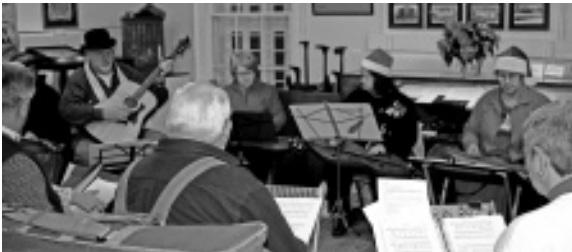
Whistle Stop Pickers play at the LCHS Christmas Open House.

Please take that old dulcimer off the shelf, or out from under the bed and join us on Saturday afternoons. All acoustic instruments are welcome. We have recently added a mandolin player. Guitars, fiddles, banjos, autoharps, and more add to the beautiful sound of the Whistle Stop Pickers. Come join in the fun. Play, listen, or dance if you wish. We are happy to have you join us.